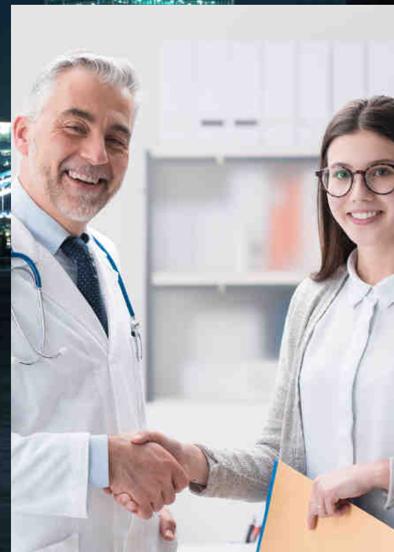
Medical Health Care for the Whole Family