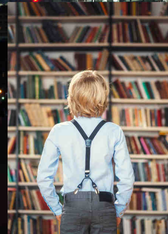
FREE Education for Dependent Children